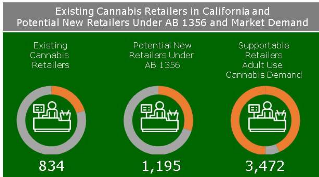
FIGURE 1: EXISTING AND POTENTIAL RETAILERS UNDER AB 1356